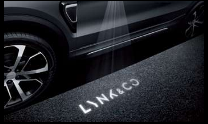
Welcome Ambient Light