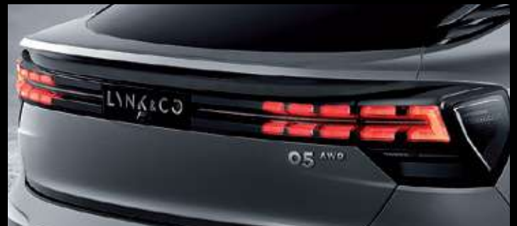
Energy Cube LED Rear Combination Lamps