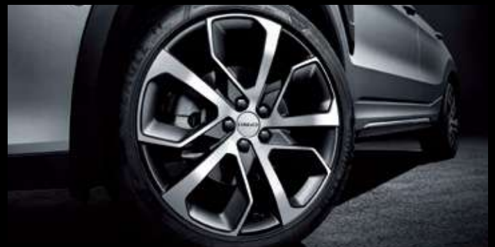
Silver Blade 20-inch Wheel Rim