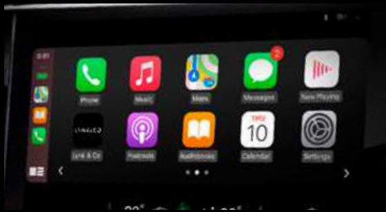
Apple CarPlay & Android Auto

MORE THAN ONE CAN THINK OF. ALL, JUST MY USUAL