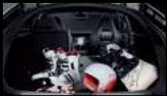
High-capacity Storage Space