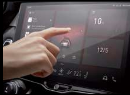
12.7-in. Touchable Center Stack