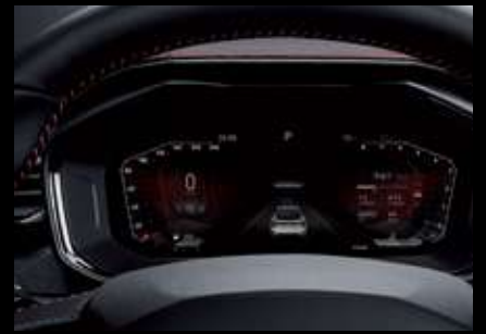
12.3-in. HD Digital Instrument Cluster