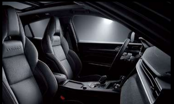
Integrated Sporty Premium Seats