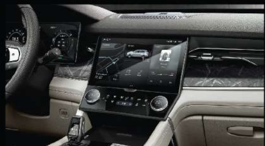
12+6 inch Touchable Center Panel