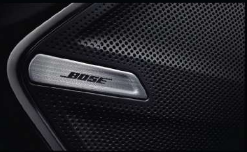
14 Speakers BOSE Audio