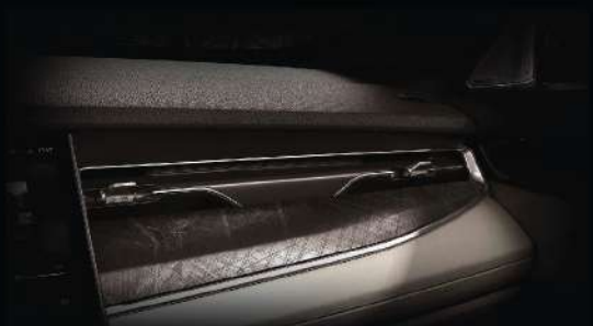
Real Aluminum Trim