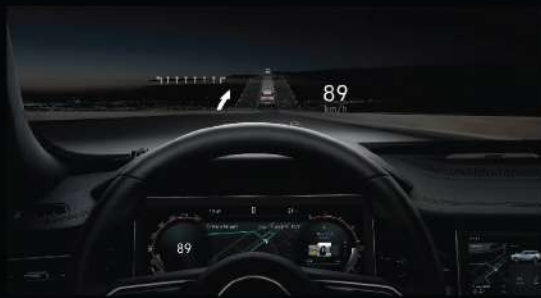
12.8 inch full-color W-HUD

The sleek interface offers a dynamic, immersive, and intuitive experience.